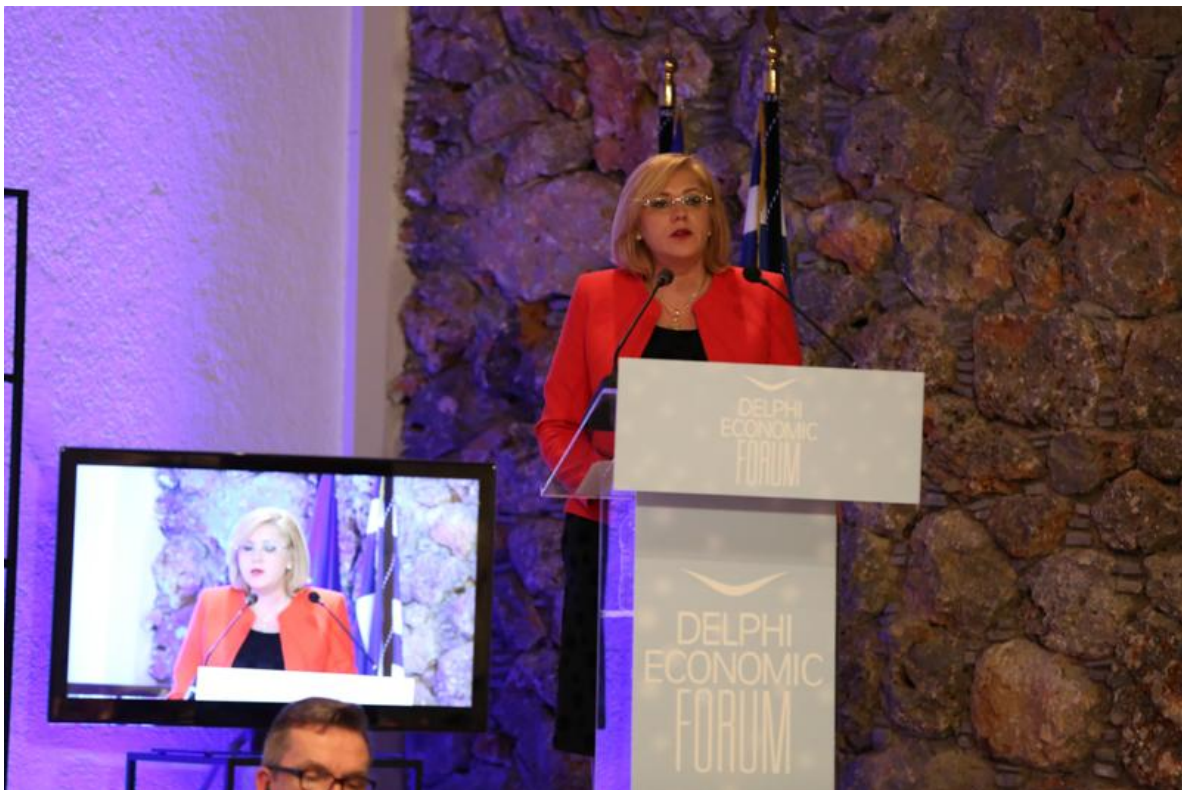
Corina Cretu, European Commissioner for Regional Policy, addressing the Plenary session