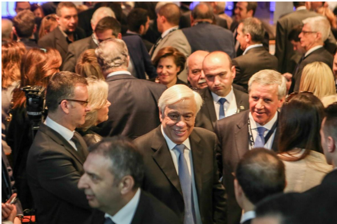
H.E. the President of the Hellenic Republic, Mr. Prokopios Pavlopoulos entering the Plenary Hall, Delphi Economic Forum

February 25-28, 2016 European Cultural Centre Delphi, Greece