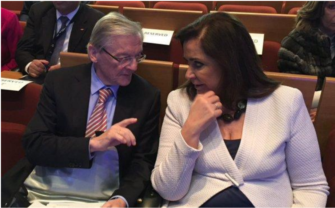
Wolfgang Schüssel, Federal Chancellor of the Republic of Austria 2000-2007, Dora Bakoyannis, former Minister of Foreign Affairs