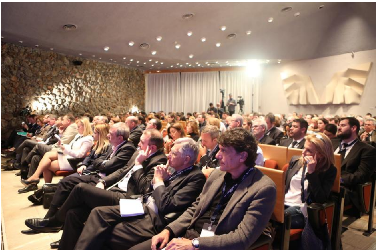
Konstantinos Karamanlis Hall, Plenary Session, European Cultural Centre of Delphi

ELIKON Graphic Arts, is a modern industrial unit that operates in the sectors of graphic arts, printing and typography. Since its creation, maintains a steady growth in the Greek market. Provides with consistency high quality services, taking full advantage of innovative technologies, respecting the needs and the deadlines of a highly demanding corporate clientele.